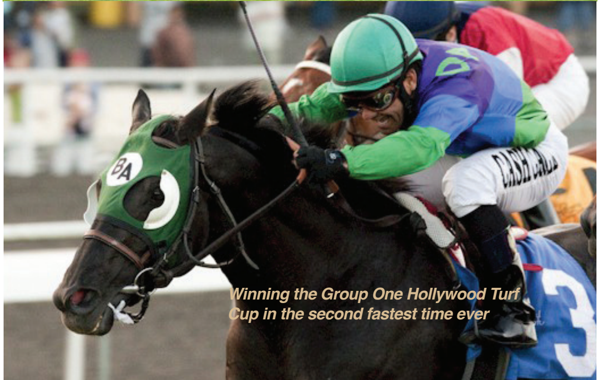
Winning the Group One Hollywood Turf Cup in the second fastest time ever